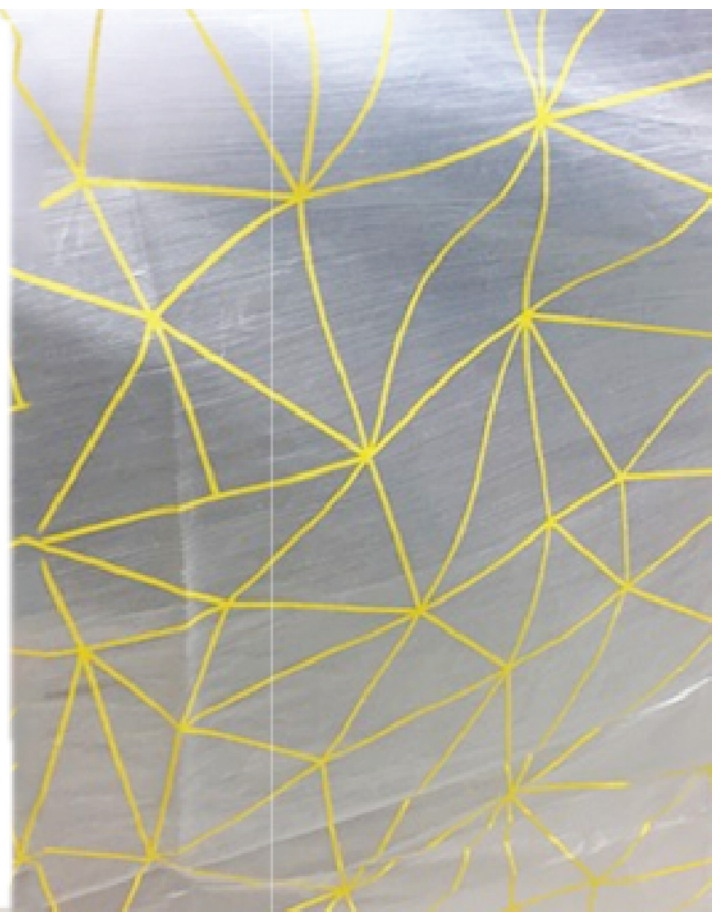
TECHPAULIN PLUS YELLOW WEB