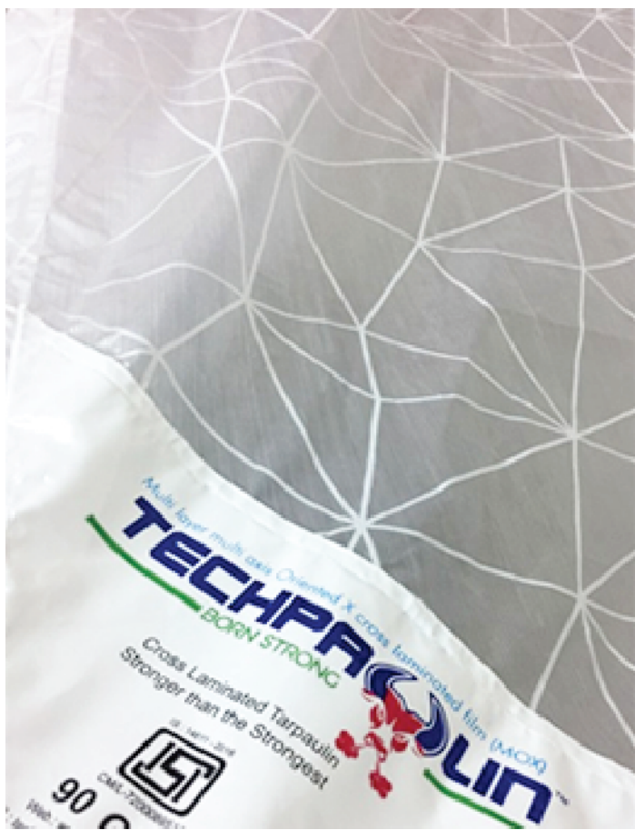
TECHPAULIN PLUS WHITE WEB