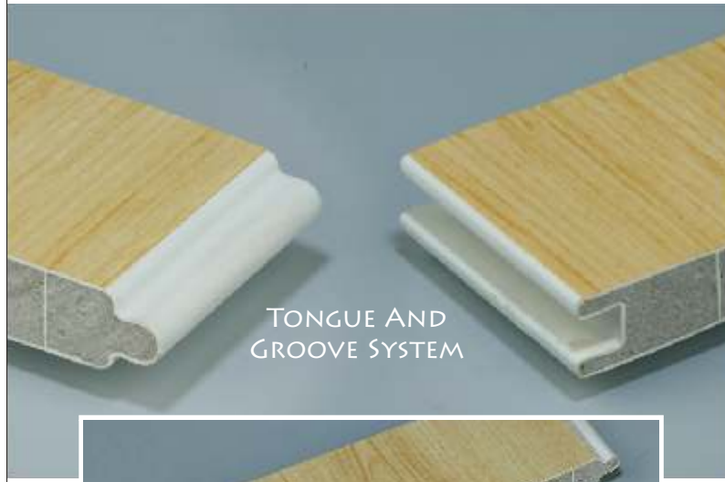
TONGUE AND GROOVE SYSTEM